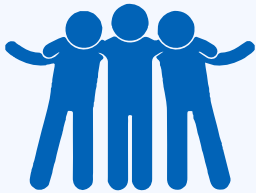
Caring for relatives