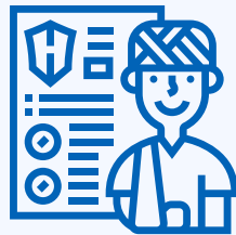
Living with health conditions