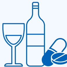
Alcohol and drugs